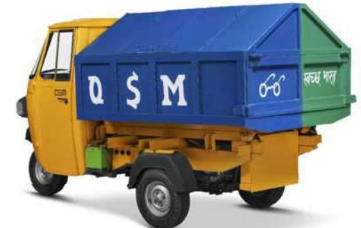
RAGE+ GARBAGE TIPPER